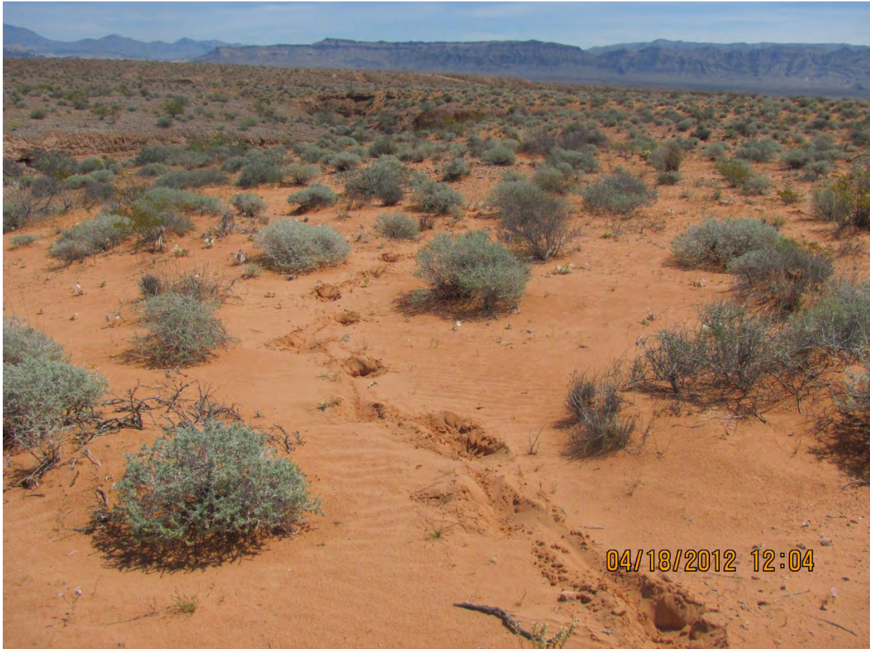
Figure 8. Cattle footprints in sandy habitat along the Valley of Fire powerline road.

The photo in figure 8 is in an area west of Northshore Road along a powerline road. This particular area has many acres of gypsum habitat and some sandy habitat intermixed with sensitive/rare species. Las Vegas bearpoppy and ringstem are located in the gypsum habitat. The sandy habitat has threecorner milkvetch and potentially sticky buckwheat.