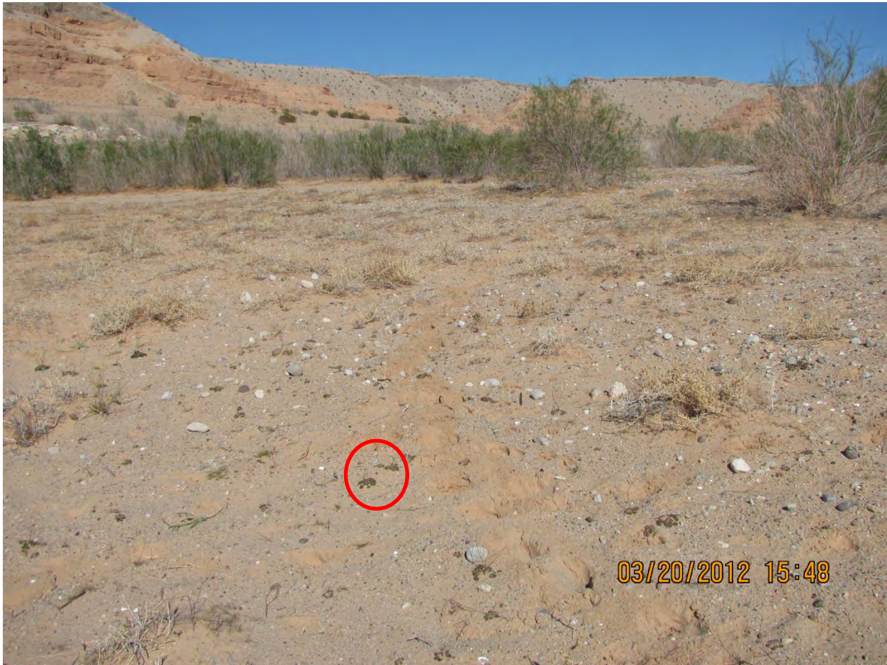
Figure 1. Cattle tracks through a population of sticky buckwheat at Lime Cove. The red circle points out the sticky buckwheat.