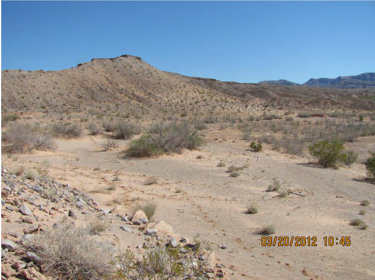
Figure 2. Cattle trails going through sticky buckwheat habitat at Lime Cove.

Sticky buckwheat, Eriogonum viscidulum , grows in sandy areas along the Overton Arm of Lake Mead. Sticky buckwheat is an annual plant which emerges around March and then flowers and sets seed by April to early May. Allowing cattle to roam free in these rare plant habitats could seriously impact the sticky buckwheat population. If the plant is stepped on or is eaten at any stage of its life cycle (actively growing, flowering, or setting seed) this will effect next year's population.