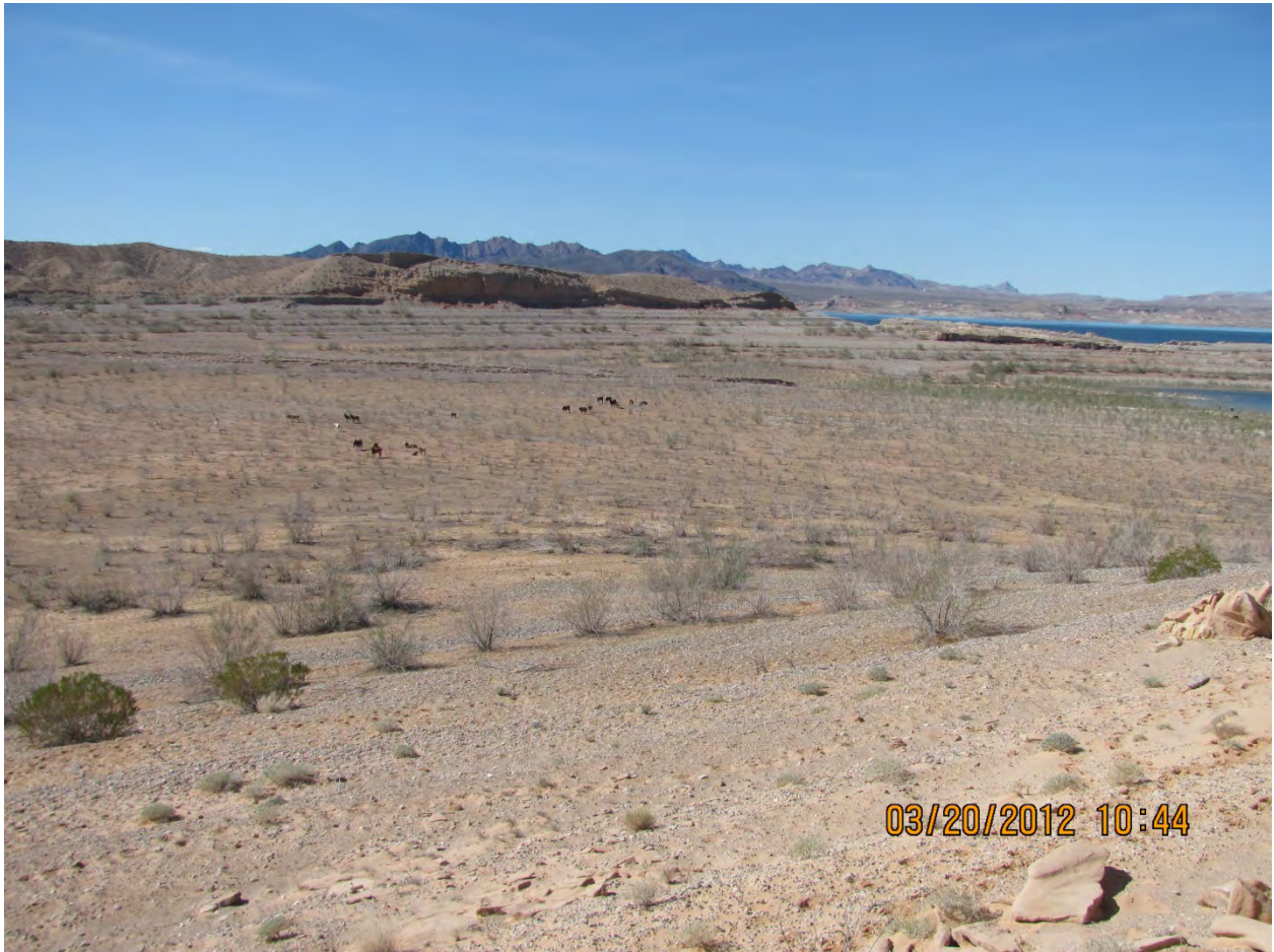
Figure 4. There were approximately 15-20 cattle in this area at Lime Cove.

The following 2 photos show the same herd of cattle just at different times (10:44 am and 9:43 am).