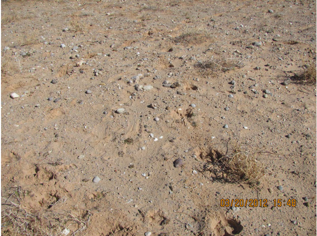
Figure 3. Close-up of cattle footprints among sticky buckwheat plants.