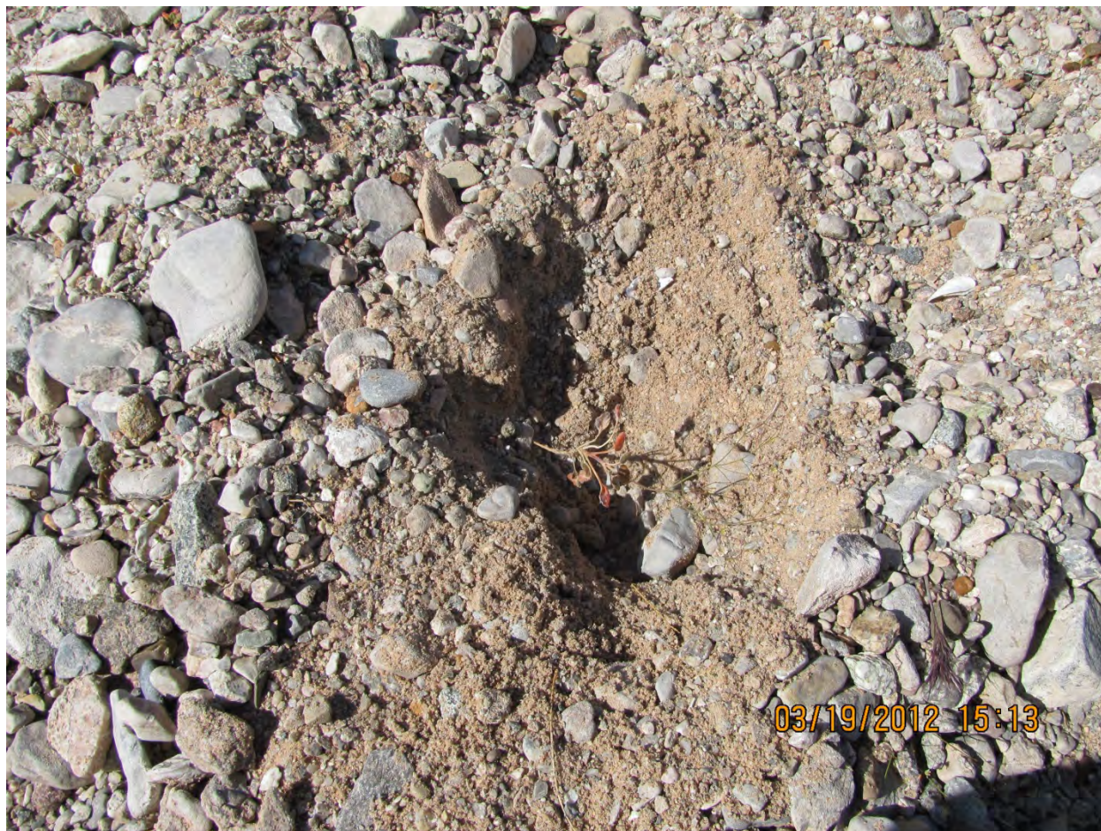
Figure 6. Sticky buckwheat that was stepped on by a cow at Lime Cove.