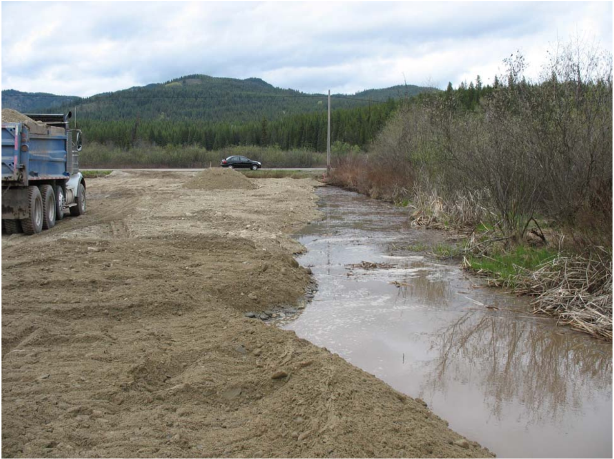
View looking north along eastern edge of property - filled area, excavated wetland area, existing wetland (left to right)