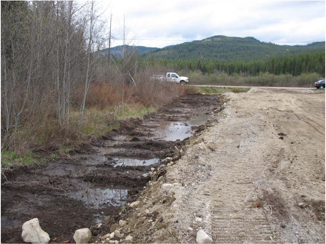
View looking north along western edge of property - filled area, excavated wetland area, existing wetland (right to left)