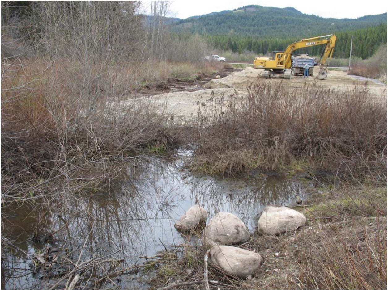
View looking north from southern edge of property