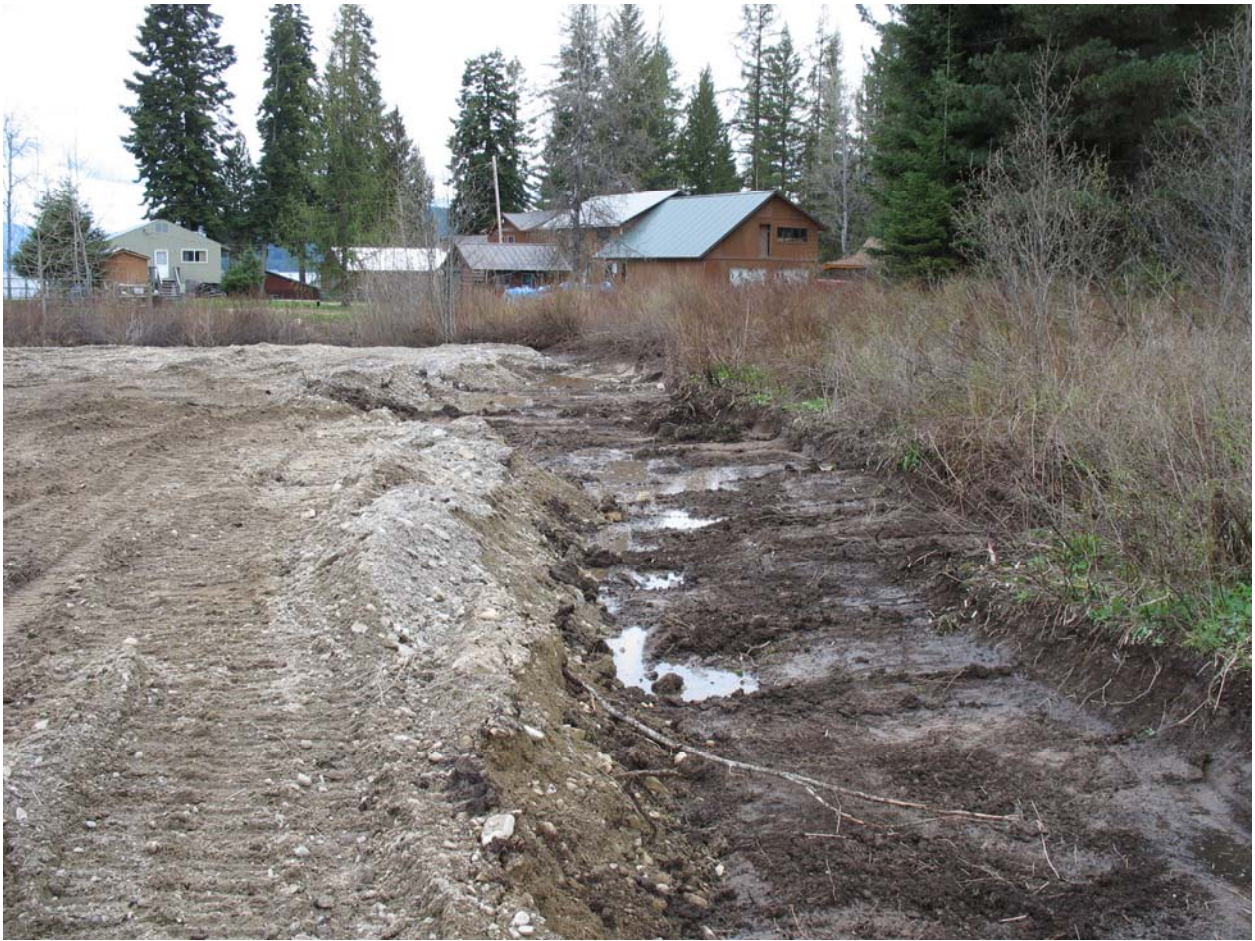
View looking south along western edge of property - filled area, excavated wetland area, existing wetland (left to right)