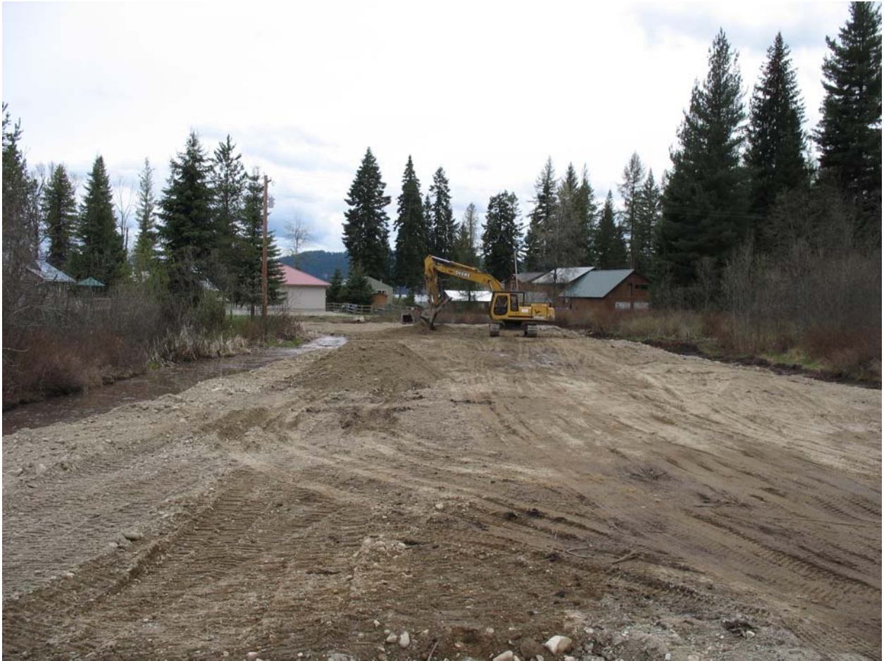
View looking south of fill material being placed on site.