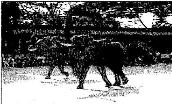
Performing elephants have killed spectators in Thailand