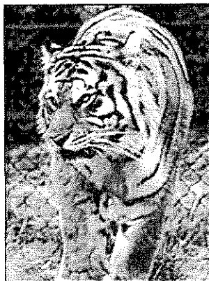
Tiger "Rajah" bit off the arm of his trainer from the famed Chipperfield circus

The AVA said it was giving a year's notice to minimise disruption to circus schedules, but stricter measures on the keeping of wild animals would be imposed in the meantime.