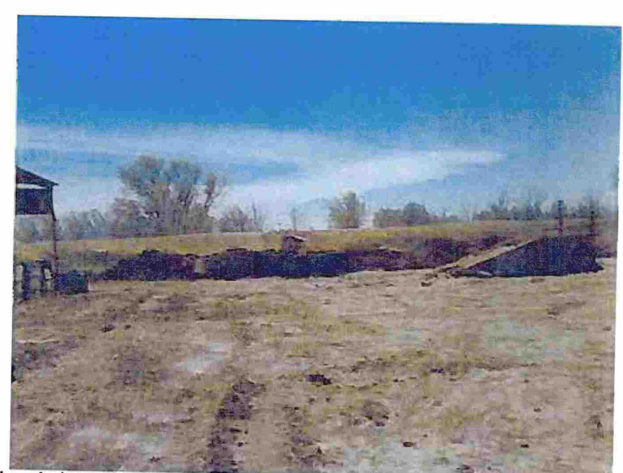
Photo depicts small piles of fresh manure that will be used to compost the piles of beef parts.