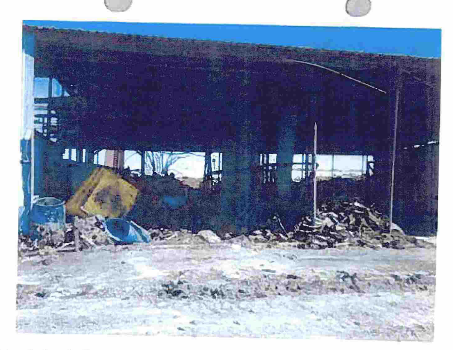
Picture depicts a shed on the East side of the facility (approximately 200 feet) showing beef skeletal bones and trash. The pile also contained parts of animals that still had muscle and hide attached.