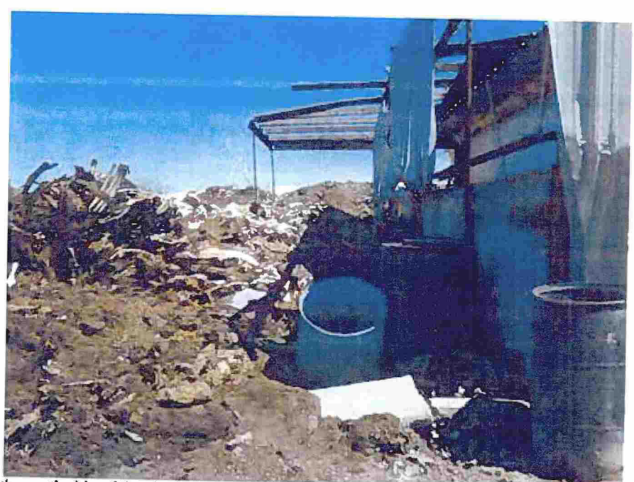
Photo depicts the north side of the shed where additional piles of dead animals and old bones are stacked up. The dirt that is on the pile is only on the surface and not layered into the piles of the dead animals.