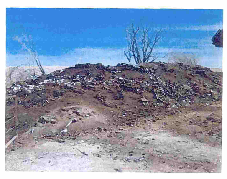
Photo depicts another pile on the back side of the shed. This pile sits next to the dirt wall that separates the dead animals and bones and the silage pit. The pile contains skeletal remains and parts with tissue still on them, as well as whole dead animals.