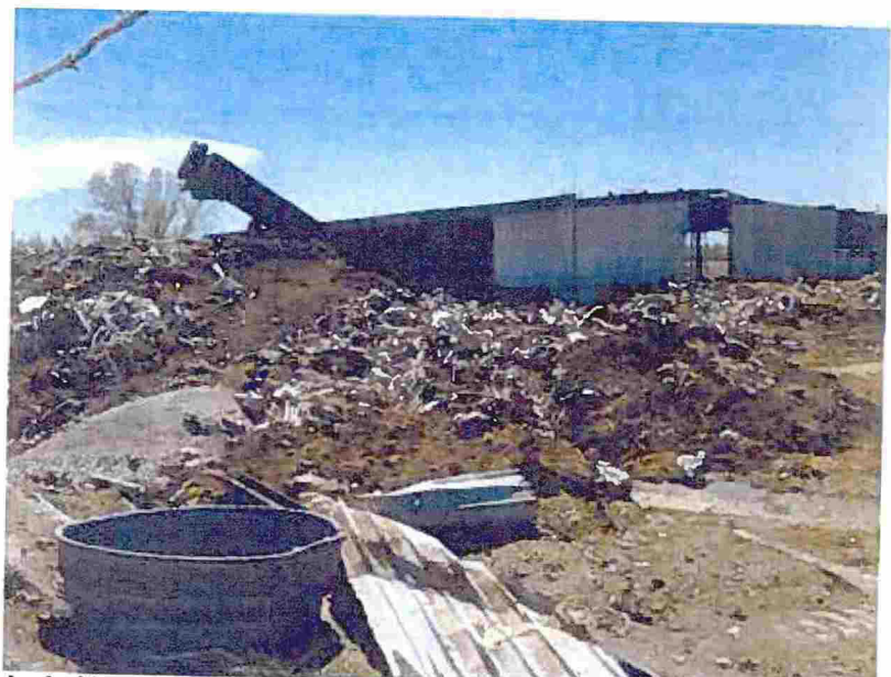
Picture depicts the back side of the shed. A pile of approximately 15 feet high is shown full of bones and animal parts, of which some still contained tissue. There is no composting, just animals piled upon each other. Some dirt has piled up on the animal remains.